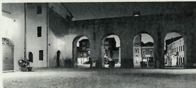
Albornoz Fortress, inside