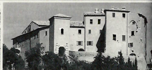
Bishop's Fortress

A perfectly preserved medieval village tied to its generous land with its wine and good food culture. It is also the capital of hospitality for its century-old tradition of welcoming tourists; here the quality of life turns every holiday into a unique experience.